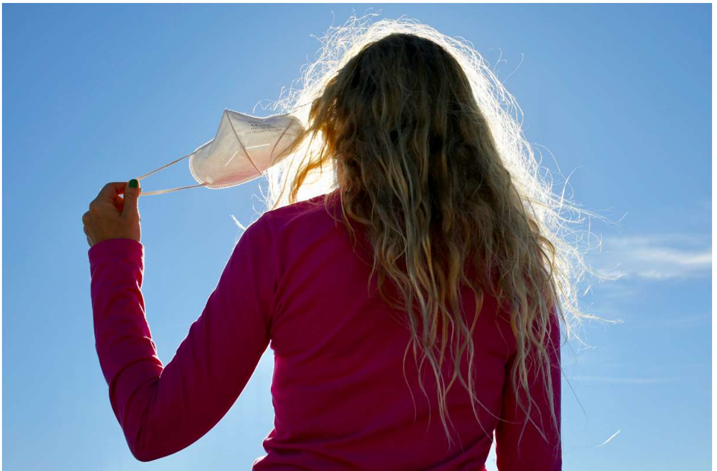
A woman in Madrid sheds her mask last month, after pandemic restrictions there were eased.