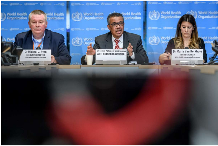
At a March 11, 2020, press briefing by the World Health Organization, Director-General Tedros Adhanom Ghebreyesus (center) publicly described the coronavirus outbreak as a pandemic for the first time.